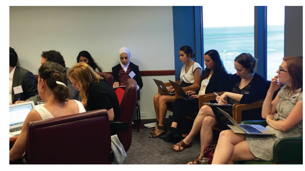
The fellows take notes during the morning research presentations from junior scholars.

"It gave us insight into the incredibly distinctive areas of study that graduate fellows from all over the country concentrate in, and how essential each scholar's voice