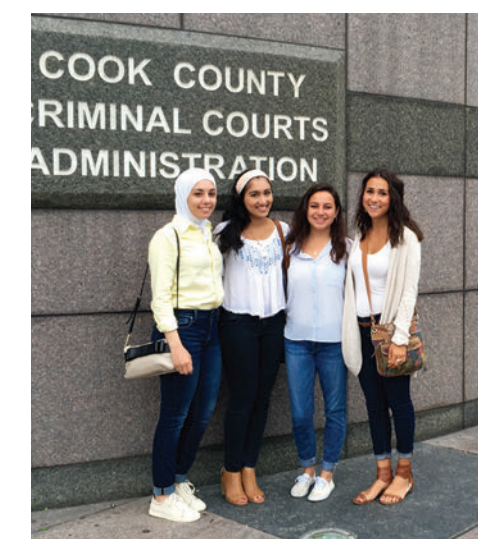
The fellows in front of the busy Cook County Criminal Court in the Little Village neighborhood of Chicago

"I also learned the difference one word can make," Dani added. In one of the last proceedings they sat in on, there was a long deliberation on whether criminal sexual assault or aggravated criminal sexual assault was more appropriate for the case.