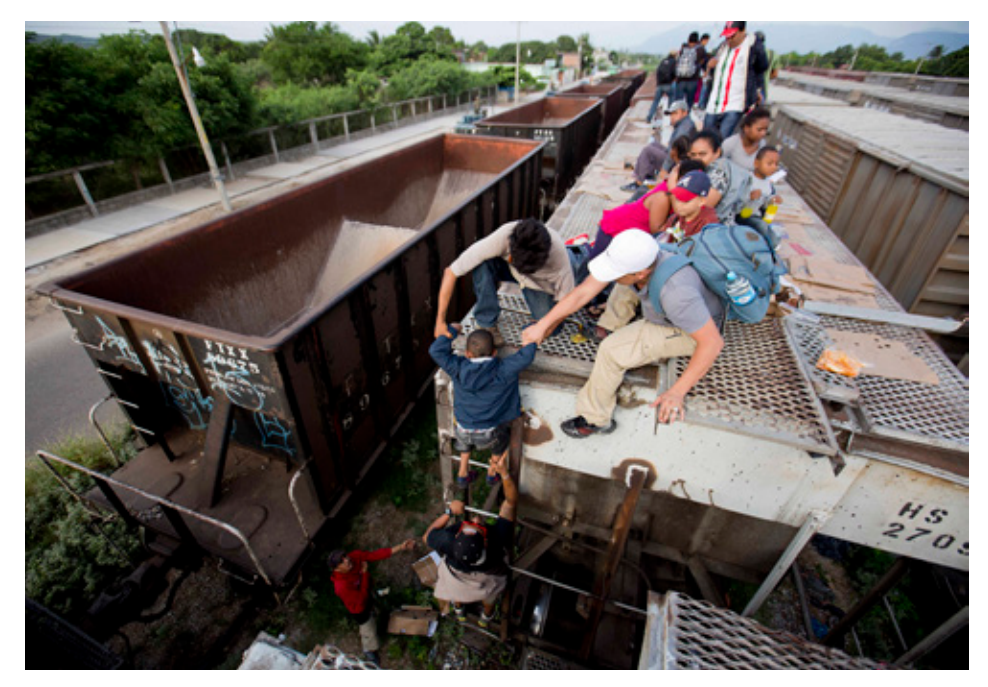
PHOTO: Central American adults and children atop a freight car in Ixtepec, Mexico, July 12, 2014.