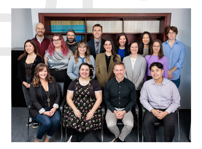
ABF Staff, November 2024